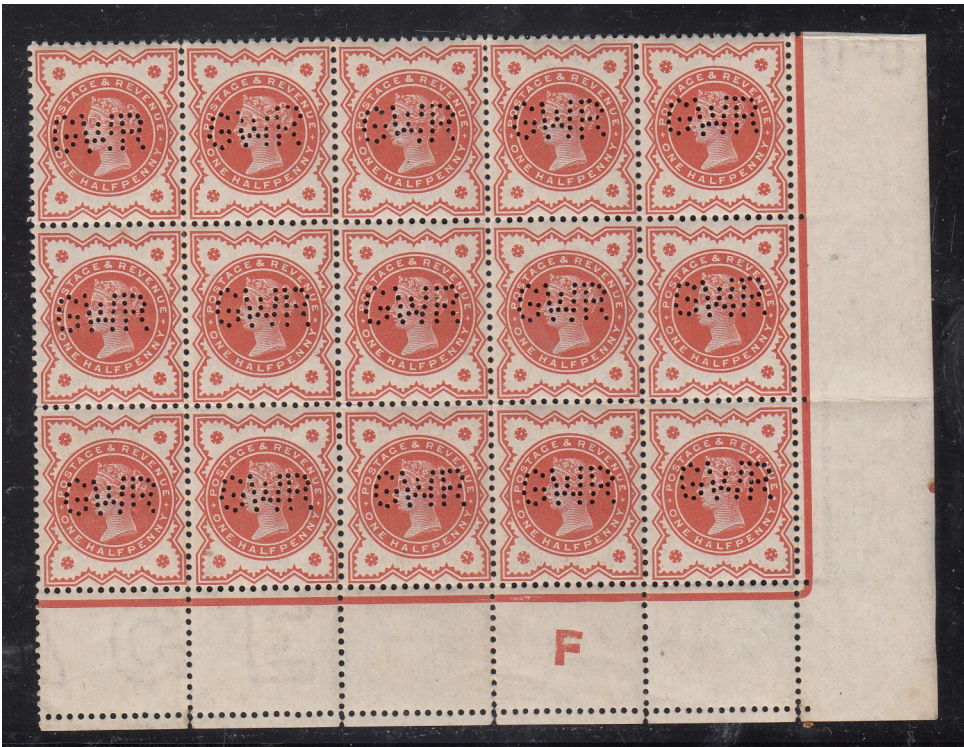
Control "F" registered September 1889 with GWR perforated initials