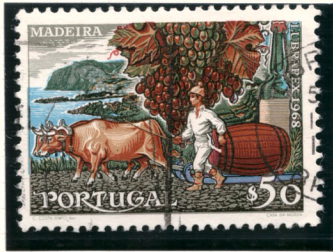
In the barrel