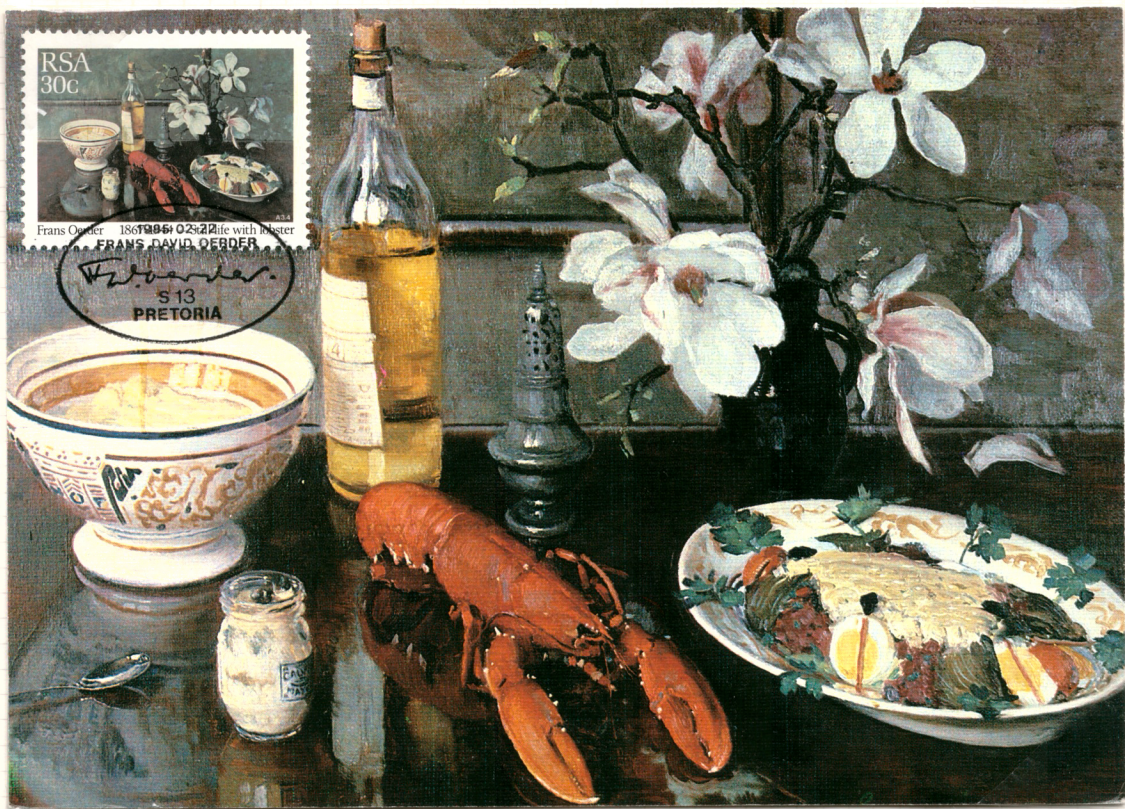
Enjoying a drink

A good wine is often considered to be an essential part of a good meal South Africa, 1985, Still Life with Lobster by Frans David Oerder