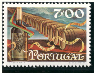
In the glass