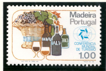
In the wine vessel